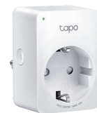
Tapo P110M Mini Smart Wi-Fi Plug, Energy Monitoring

Your Tapo Matter devices in your local area network (LAN) are responsive with lower latency and remain accessible even when the household goes offline.